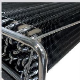
Evaporator with anti-corrosion treatment (cataphoresis)