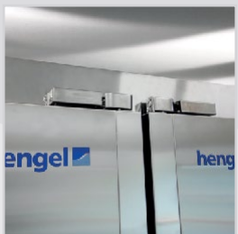
Automatic closing door with hydraulic actuator placed outside to avoid any risk of corrosion