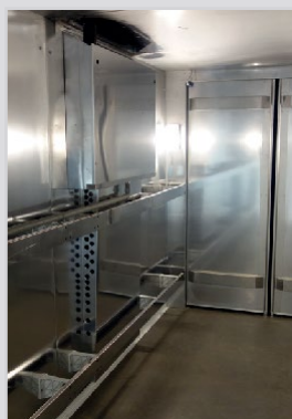
Technical service duct fitted vertically for easy maintenance and cleaning