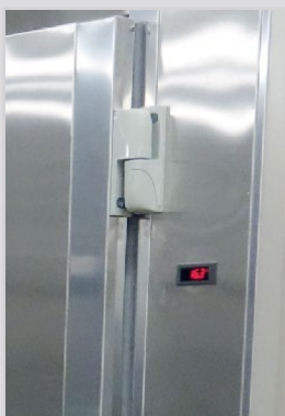
Temperature display on the exit side of the trolleys